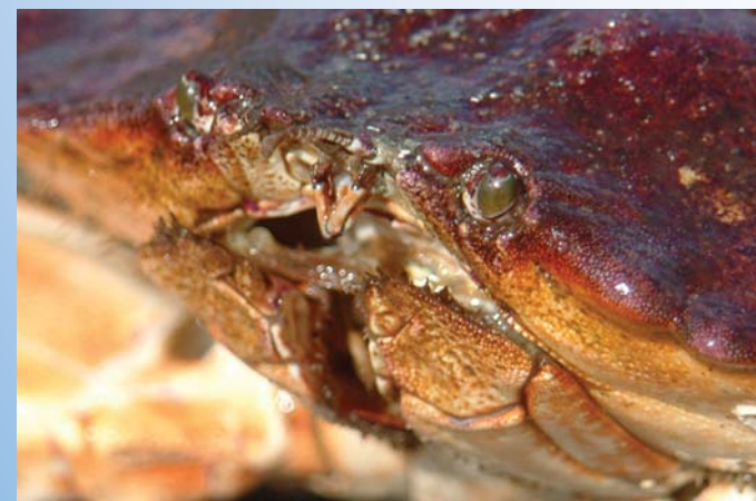
Crab close up.

Notably high catches were recorded during the 2003 and 2004 fishing seasons, measuring more than 6,000 tonnes per year (see graph). 2