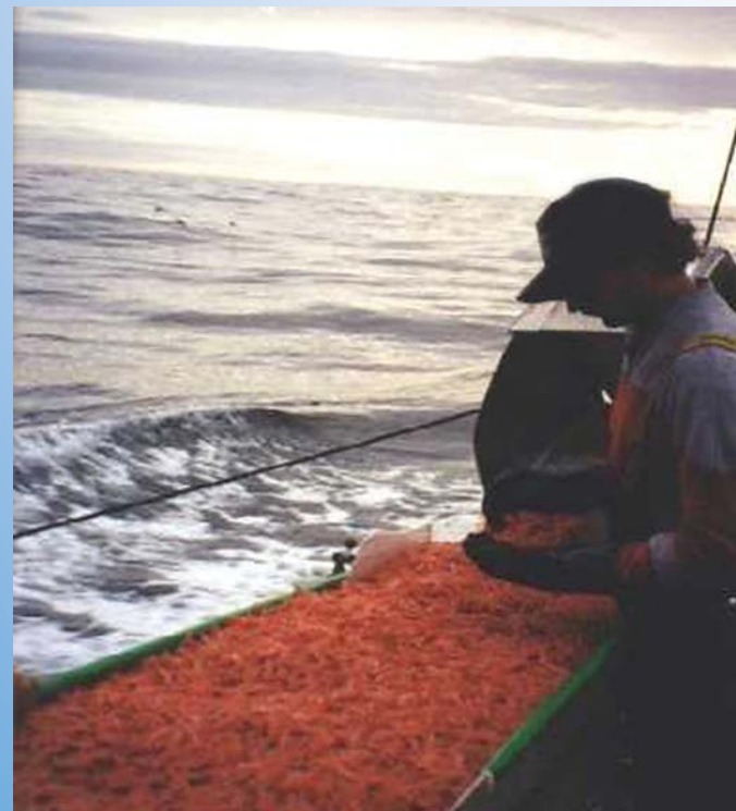
Shrimp trawl.

Management measures include catch monitoring, stock assessment, and the use of Shrimp Management Areas to manage opening times, closing times and the Total Allowable Catch ceiling. 2 Of the 36 Shrimp Management Areas along the BC coast, 15 are located entirely within PNCIMA, and five are partially located within PNCIMA. 5