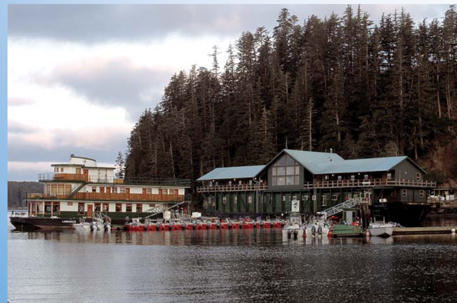
Langara Fishing Lodge (Haida Gwaii).