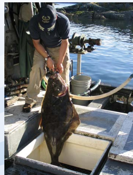
Sport fishing in Broughton.